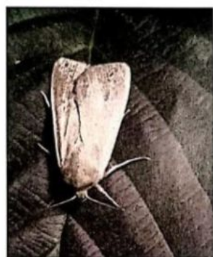
Brown moth.

Butterflies and moths are insects, and like all insects they have three pairs of legs. Their bodies are divided into three sections: head, thorax , and abdomen . On either side of the head is a large special eye. These eyes are able to detect the smallest movement. But they cannot see faraway things very clearly.